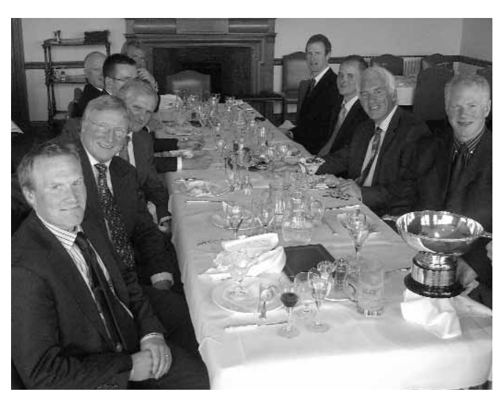
Society vs Faculty Golf Match